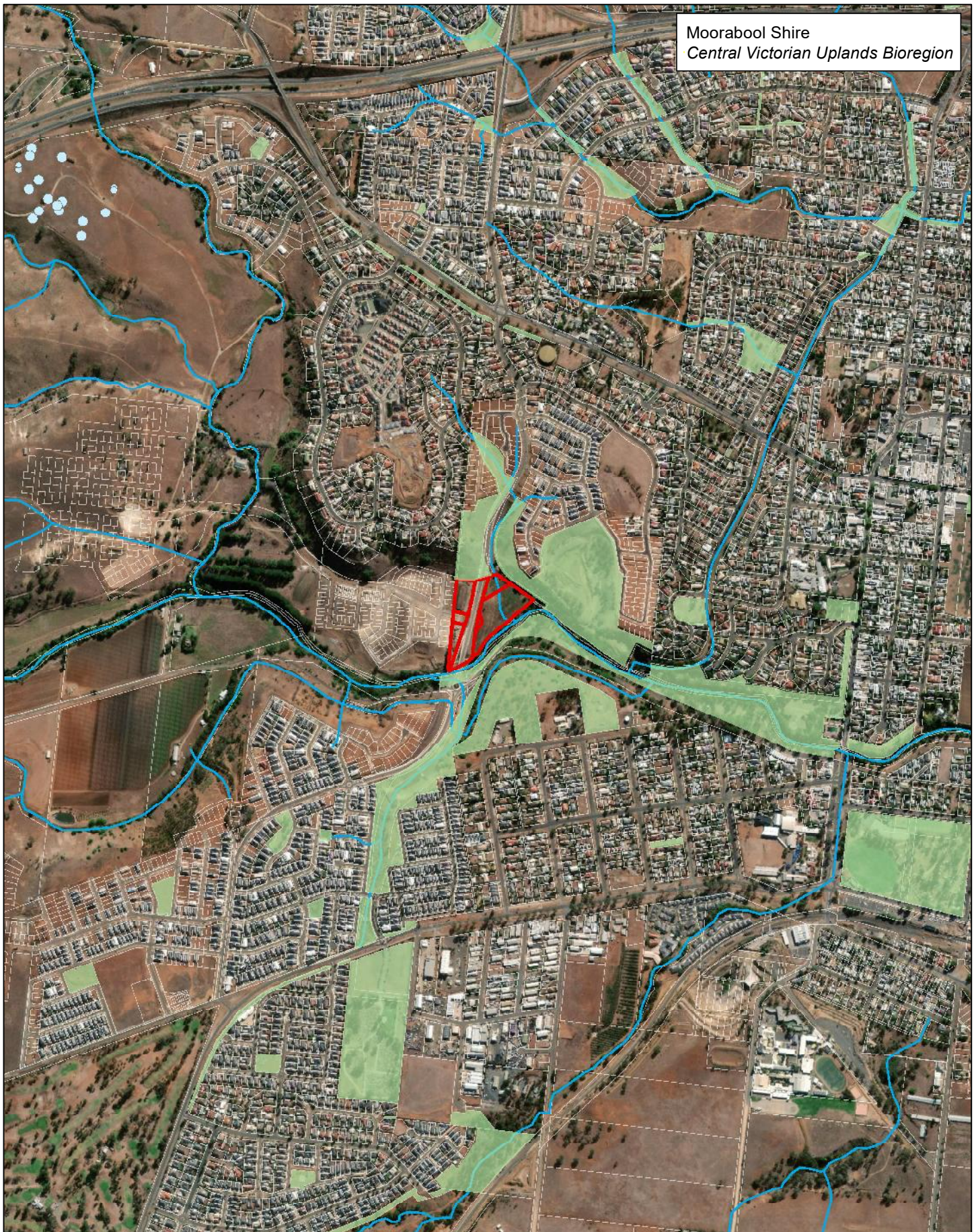
Figure 1. Location and Context of Study Area at Halletts Way, Bacchus Marsh

Moorabool Shire Central Victorian Uplands Bioregion