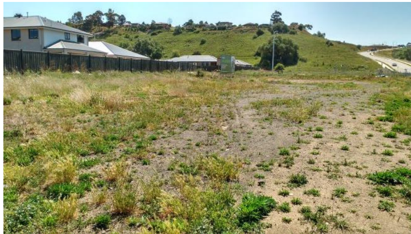
Image 5. Lot B, facing north, showing bare ground and weeds (Abzeco 02/10/2020)

Vegetation is dominated by grassy and herbaceous weeds including Chilean Needle-grass *Nassella neesiana , Barley-grass, Cocksfoot *Dactylis glomerata , Cat's Ear *Hypochoeris radicata , Ribwort *Plantago lanceolata , Twiggy Turnip *Brassica fruticulosa , Prickly Lettuce *Lactuca serriola and Galenia. Lot B does not support any shrubs, however, a small windbreak of Australian native Swamp Sheoak are in the south-west (Image 6; Figure 2). This species is not indigenous to the local area and is therefore not included in offset calculations. The stand of Swamp Sheoak has provided protection from slashing for approximately five Fragrant Saltbush Rhagodia parabolica specimens (Image 7). This species is listed as rare in Victoria (see Section 2.4).