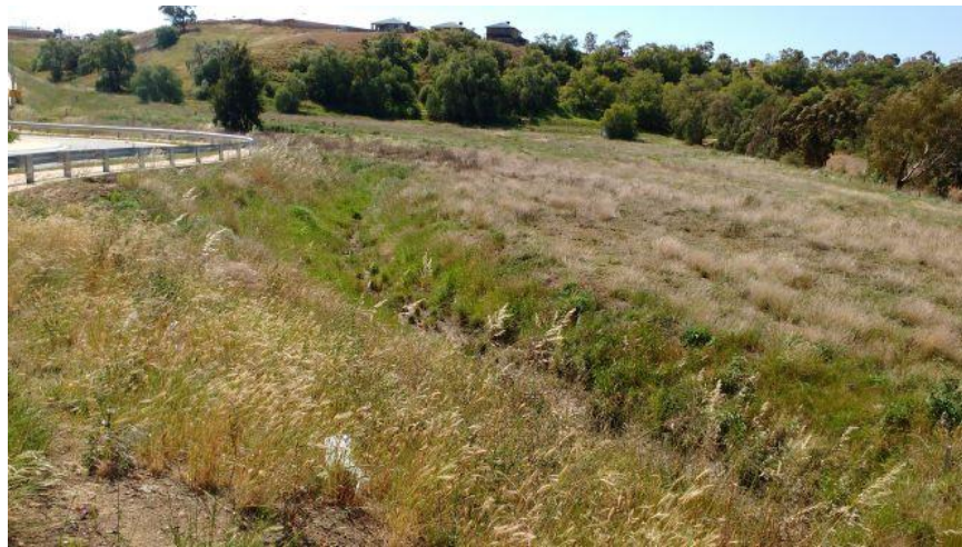
Image 10. Lot D is substantially lower and slopes moderately to toward the Werribee River corridor (Abzeco 02/10/2020)

Weed cover is extremely high (>95%) with only scattered occurrences of indigenous species such as Nodding Saltbush Einadia nutans subsp. nutans present along fence lines and Common Cotula Cotula australis in disturbed or regularly slashed sections. Other than one small Hege Wattle Acacia paradoxa behind the tin shed and one Sifton Bush Cassinia sifton in the open heart of the lot, shrub species are absent. Furthermore, only two canopy trees occur within Lot D; one Swamp Sheoak in the north-west (see Image 8) and one indigenous River Red-gum Eucalyptus camaldulensis in the southern tip.