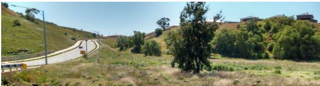
Image 8. View to the north over Lot C from Lot D showing exotic trees in the bordering drainage line (Abzeco 02/10/2020)

Lot C (north-east): Lot C is small trapezoidal shaped parcel covering approximately 0.3 hectares and slopes gently to the south and east toward the Weribee River corridor. Lot C is bordered by a strip of planted and self-recruited exotic trees to the north-east, associated with a minor drainage tributary to the Werribee River (Image 8). Canopy species within the drainage line include Willow * Salix spp. and Pepper Tree * Schinus mole , however, only one Pepper Tree is closely associated with the northern point of the lot. No shrubs are present and the understory is dominated by weeds (Image 9).