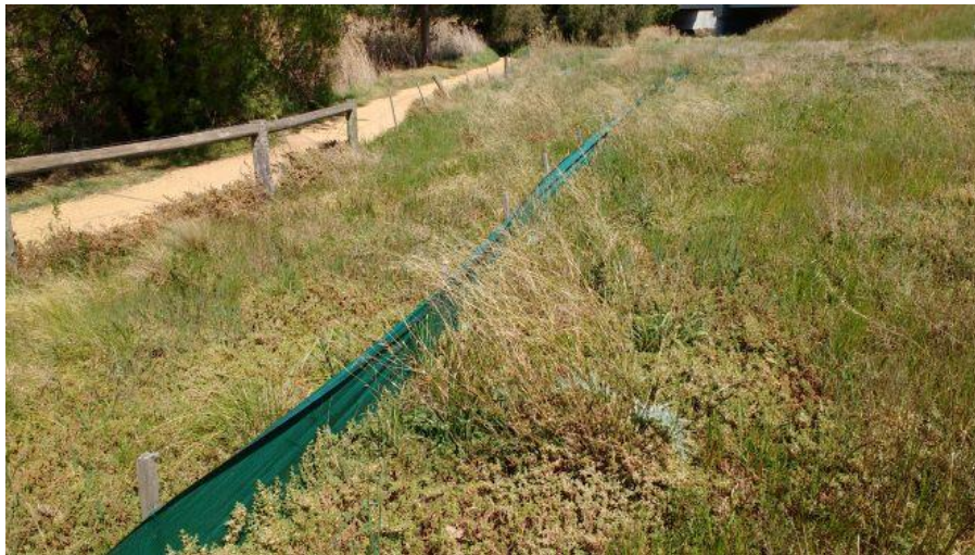
Image 12. Frog exclusion fencing at the southern end of Lot D (Abzeco 02/10/2020)

Given the close association of Lot D to the Werribee River corridor, there is a low likelihood that a species such as Growling Grass Frog may occasionally utilise the study area for foraging purposes or to overwinter. However, it should be noted that there is an existing frog fence to restrict access and use of the relevant section of Lot D (Image 12) and Lot D will also not be developed as it is below the 100-year flood level.