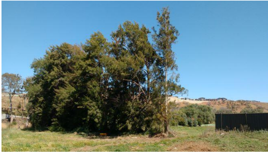
Image 6. Small windbreak of the Australian native Swamp Sheoak in Lot B (Abzeco 02/10/2020)