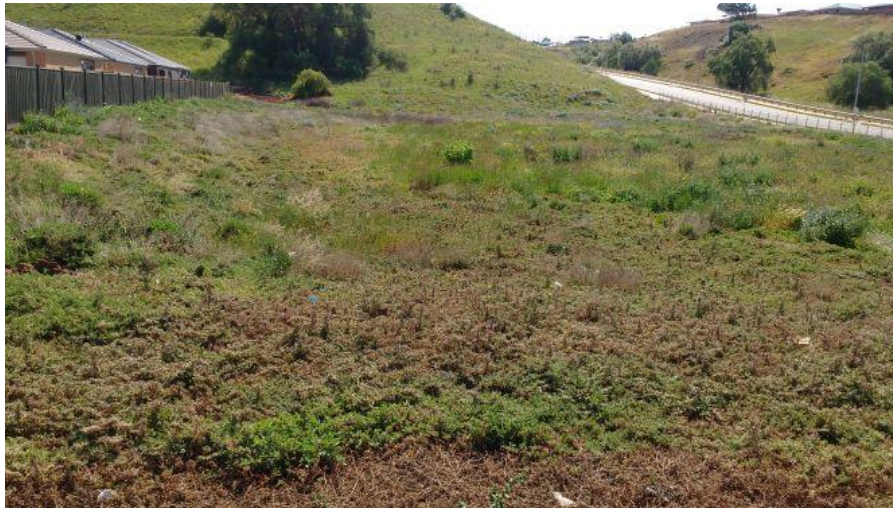
Image 2. Lot A, facing north, showing high weed cover especially Galenia (Abzeco 02/10/2020)

Lot A (north-west): Lot A is rectangular, covers approximately 0.5 hectares and is defined by residential fencing to the west, a relatively steep hillside/escarpment to the north, and arterial roads to the east and south (Image 2). The lot is dominated by a wide range of grassy and herbaceous weeds including Barley-grass *Hordeum spp. , Perennial Rye-grass *Lolium perenne , Bearded Oat *Avena barbata , Sow Thistle *Sonchus olearaceus , Hogweed *Polygonum aviculare , Curled Dock *Rumex crispus , Paterson's Curse *Echium plantagenium and a very high cover of Galenia *Galenia pubescens (Image 3). No trees or shrubs occur within Lot A and the only indigenous plant identified was a single Cotton Fireweed Senecio quadridentatus , which is a ruderal species often found in disturbed sites (seen front-left – Image 3).