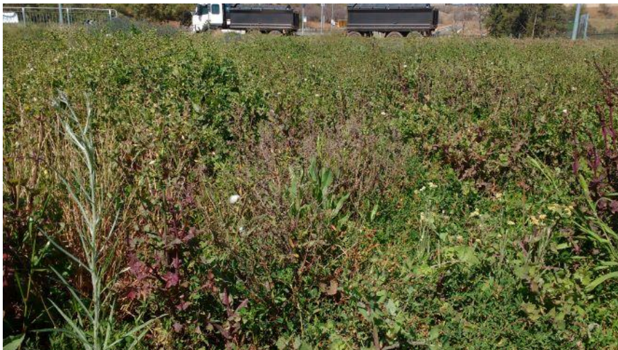
Image 3. Lot A, facing south, showing the high density of thistles (Abzeco 02/10/2020)