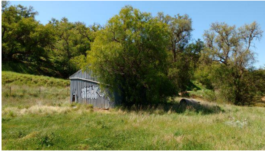
Image 11. The north-east corner of Lot D showing the tin shed and exotic Pepper Tree (Abzeco 02/10/2020)