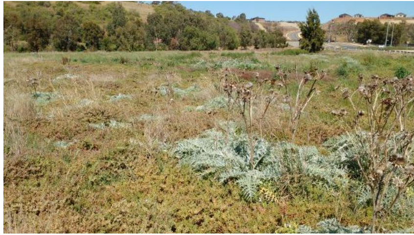
Image 9. Lot C is dominated by wide variety of exotic understorey weed species

Lot D (south-east): Lot D is roughly trapezoidal and covers approximately 1.8 hectares. This section is substantially lower than Lots A-C with the majority of the land parcel below the 100 year flood level and sloping moderately in parts to the south and the Weribee River corridor (Image 10). Lot D supports a large tin shed in the north-east corner that is flanked by a semi-mature Pepper Tree (Image 11). The Werribee River shared trail is immediately adjacent the eastern boundary.