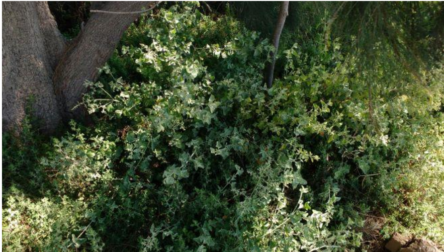
Image 7. Fragrant Saltbush beneath Swamp Sheoak – Lot B (Abzeco 02/10/2020)

Lot C (north-east): Lot C is small trapezoidal shaped parcel covering approximately 0.3 hectares and slopes gently to the south and east toward the Weribee River corridor. Lot C is bordered by a strip of planted and self-recruited exotic trees to the north-east, associated with a minor drainage tributary to the Werribee River (Image 8). Canopy species within the drainage line include Willow * Salix spp. and Pepper Tree * Schinus mole , however, only one Pepper Tree is closely associated with the northern point of the lot. No shrubs are present and the understory is dominated by weeds (Image 9).