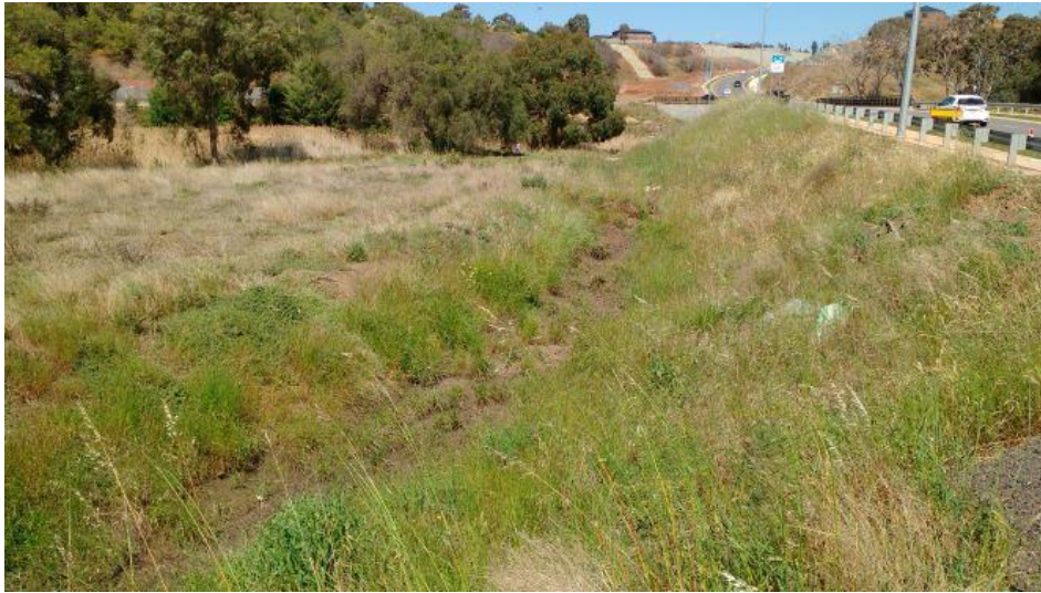
Image 1. Lot D, facing south along the drainage line toward Werribee River (Abzeco 02/10/2020)