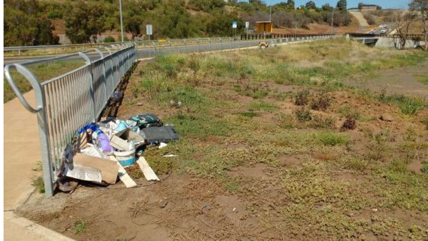
Image 4. Lot B, facing south, showing dumped rubbish and bare ground (Abzeco 02/10/2020)

Lot B (south-west): Lot B is a narrow triangular parcel covering approximately 0.28 hectares and slopes moderately to the south toward the Weribee River corridor. The lot is further defined by residential fencing and a tree windbreak to the west and arterial roads to the north and east. Some dumped rubbish is present and large areas of bare ground and minor erosion are present throughout (Images 4 & 5). The site is heavily disturbed from past agricultural use and recent roadworks to extend Halletts Way. An informal access track runs through the centre of the lot likely used by both pedestrians and maintenance vehicles and machinery.