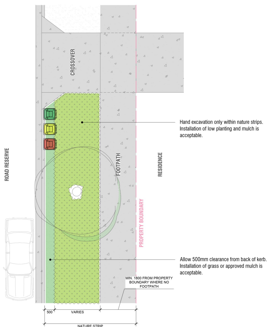
FIG. 1. PLAN OF PERMITTED LANDSCAPING FOR YOUR NATURE STRIP